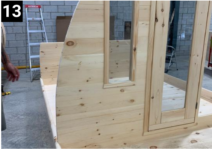
13 Place side wall in as shown.