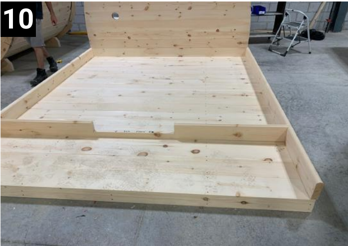
10 At this stage install floor cleats to secure sauna to floor. These are premade 2x4's with pocket holes in them.