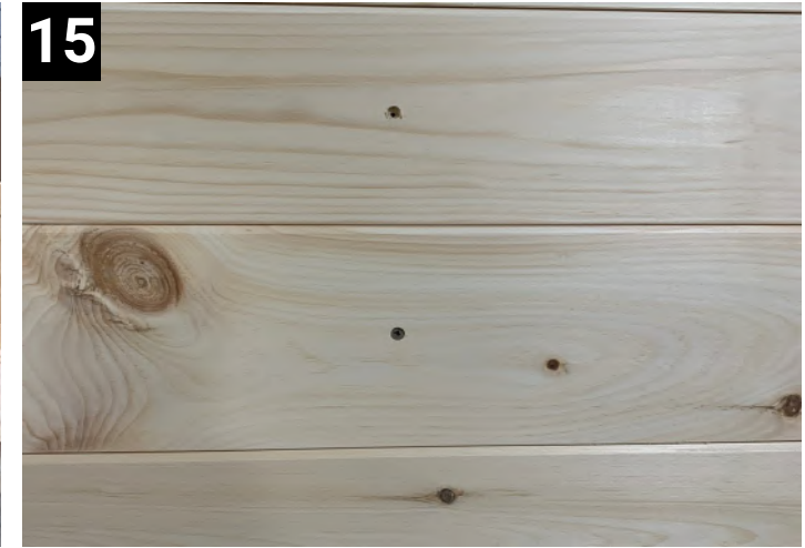
15 Fasten each stave with one screw at each end into wall boards