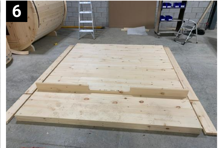
6 Place a stave on each side to be ready for assembly