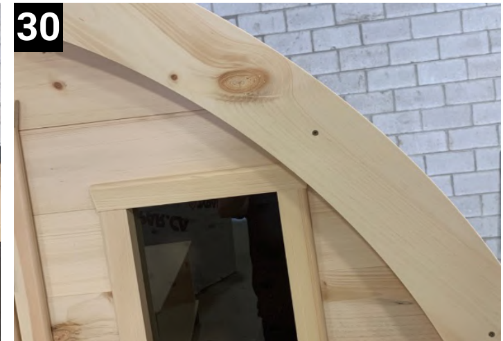
30 Put 3 screws into each bargeboard