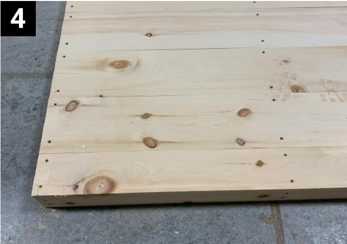
4 Fasten floor down on 2 outside floor beams but not down Center isle. Leave it