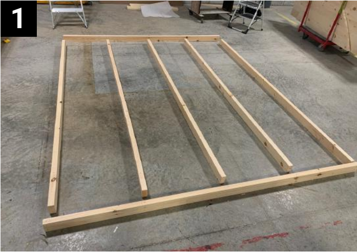
1 Line up boards as shown and fasten with two screws into the ends