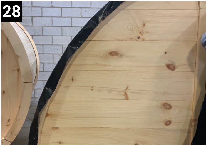
28 Cut excess membrane off. Staples hold it in place.