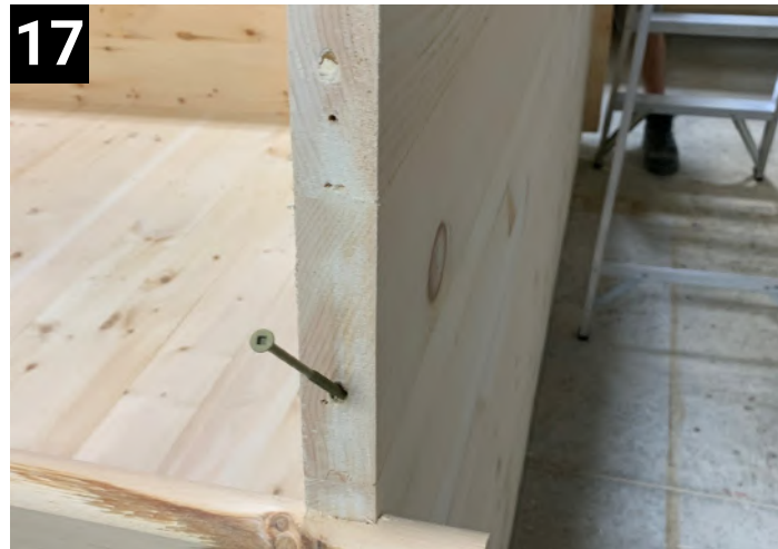
17 Use 4" screws on angle to fasten wall together with last section