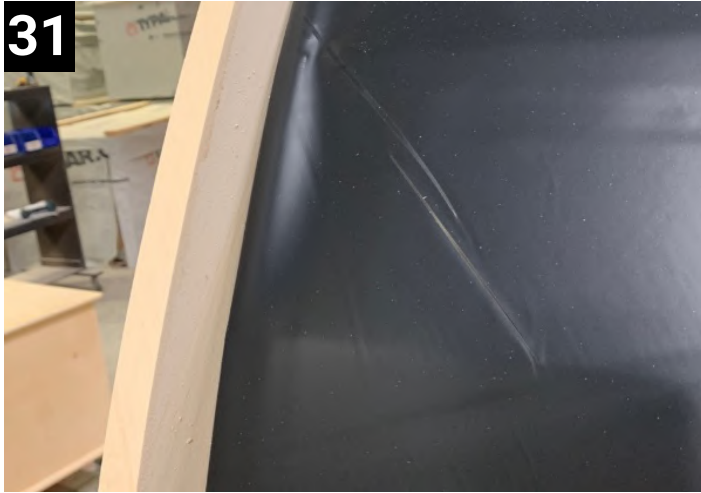
31 barge boards clamp down membrane