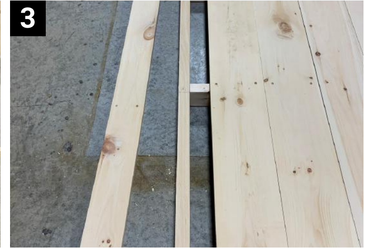
3 Put last narrow floor board at back of sauna