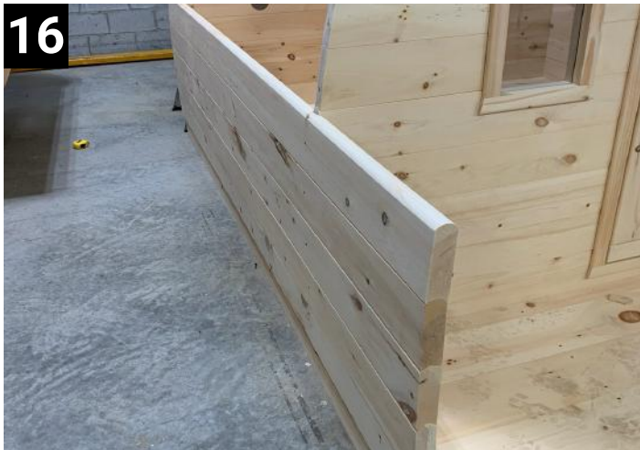
16 STOP, STOP, Stop at 5 staves high on each side. Now install benches. This is the only stage benches will fit in.