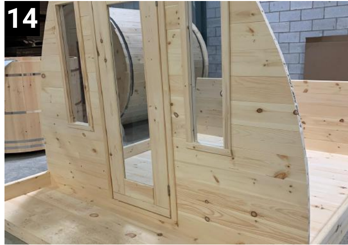
14 Place final side in and start putting stave on. Stop at 5 high to put benches in