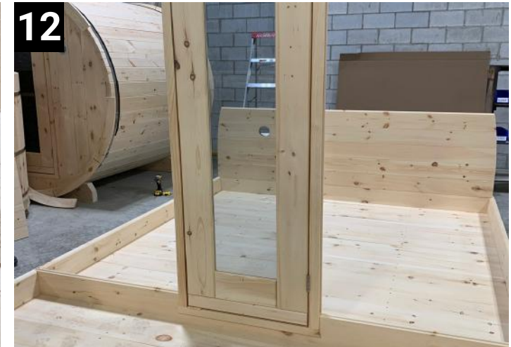
12 Place door in as shown