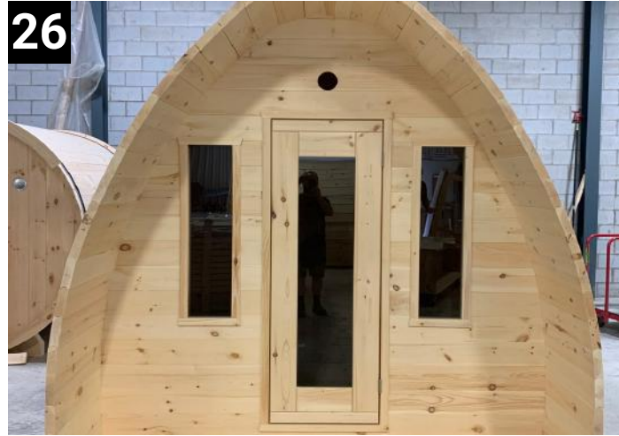
26 Finished front look