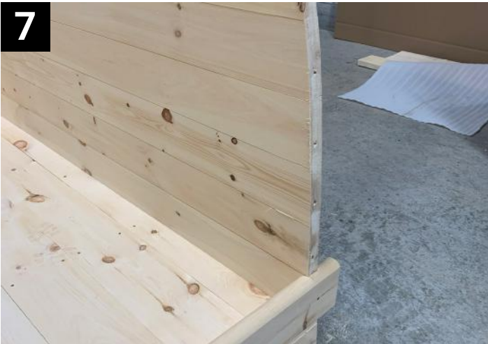
7 Place back wall now and fasten