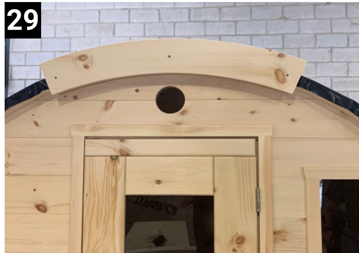
29 Install barge boards now.