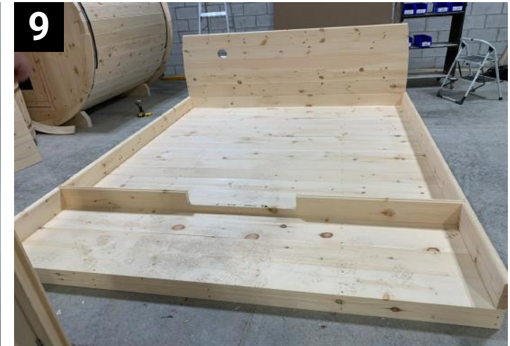
9 Put bottom front wall in and bottom back wall in