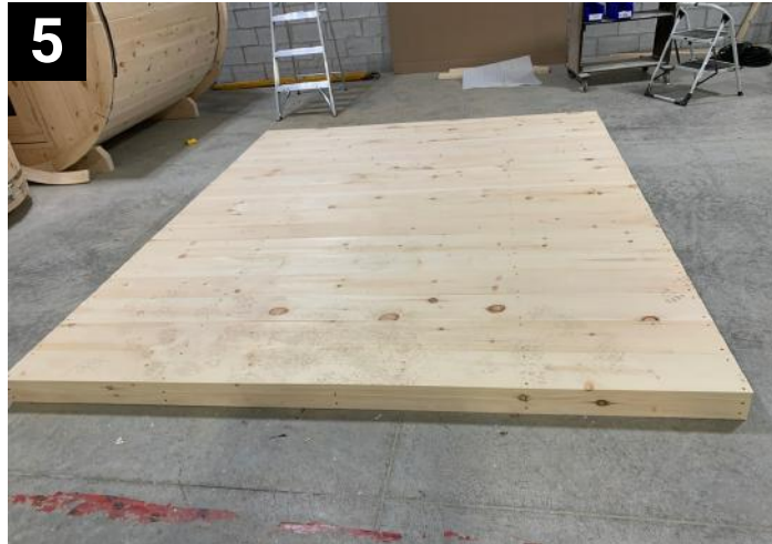
5 Finished floor look