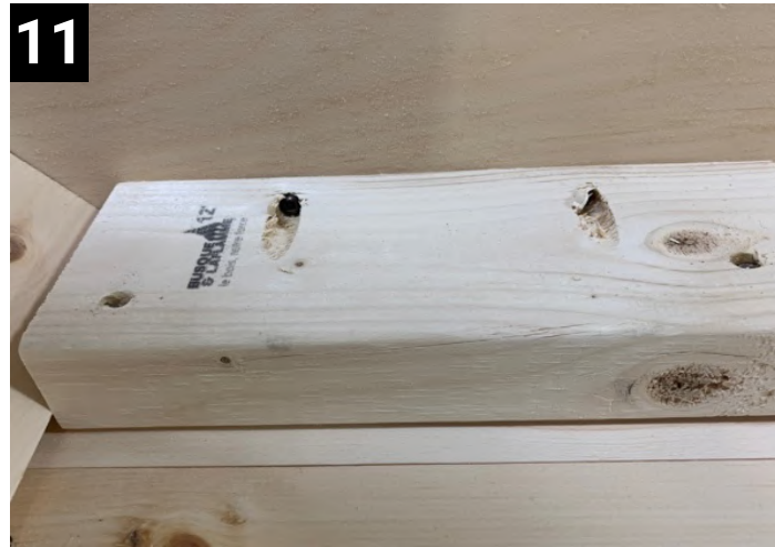
11 Put in floor cleats, screw into picket holes to hold stave then down into floor to secure everything