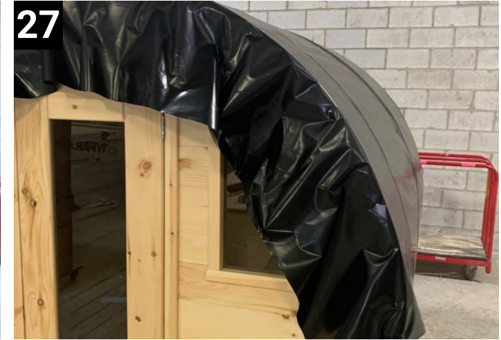
27 put membrane over and over lap ends. Staple down on ends of staves.