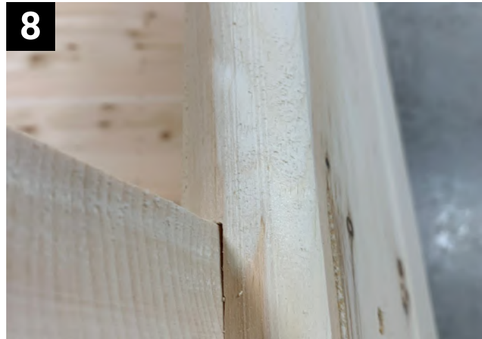
8 When fastening staves on walls put tight. No gap between wall and stave