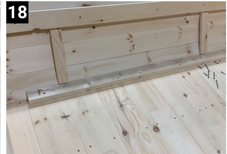
18 for bench height 2x4 support use measuring sticks as shown. fasten 2x4 to stave for benches to sit on.