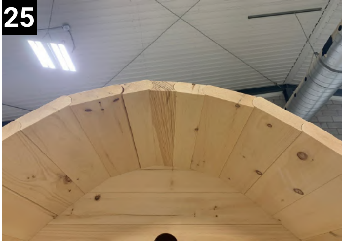
25 Top staves is now down and all staves are in place and screw all down with 3" screws