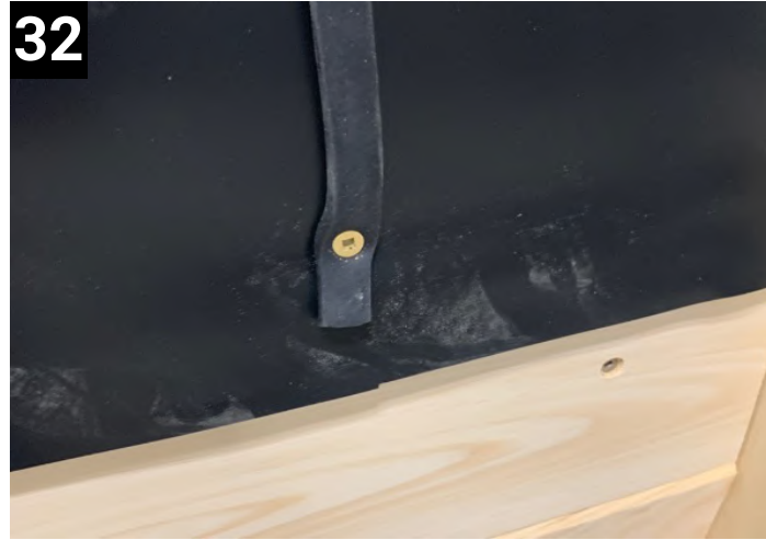
32 Put rubber strips over top and fasten on each end. put strips about 6" from ends of sauna. if a 3rd is needed, center