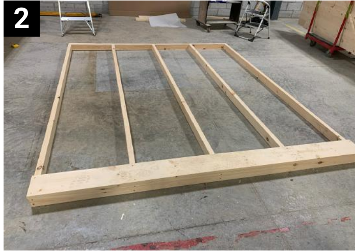
2 Start with wide floor boards and fasten down. Leave Center isle with no screws.